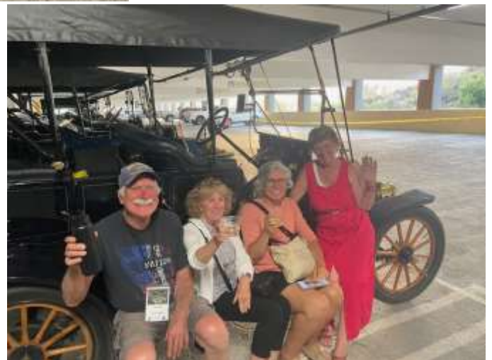
End of Day (everyday)