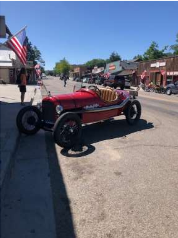
Main Street in Julian, California