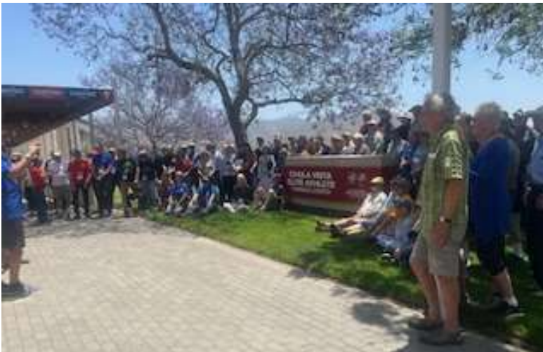
Chula Vista Elite Athlete Training Center