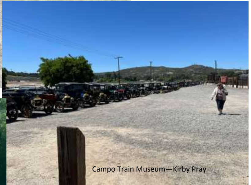
Campo Train Museum—Kirby Pray