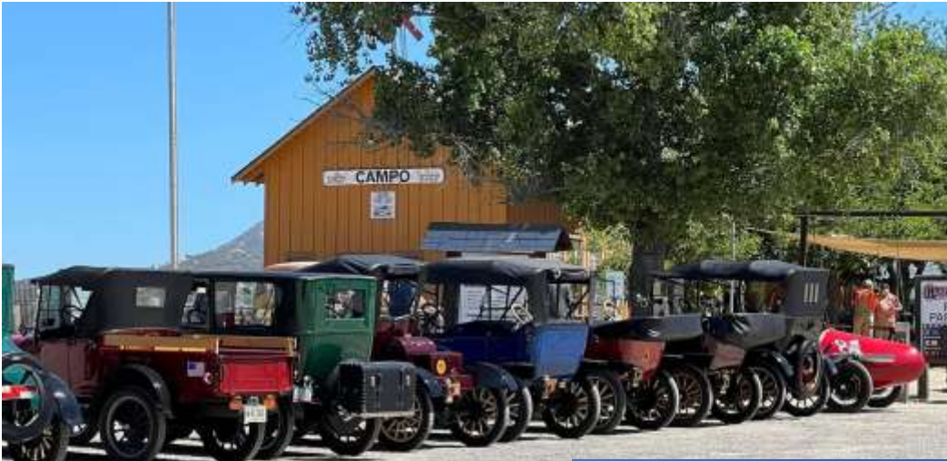
Campo Train Museum—Judy Burrell