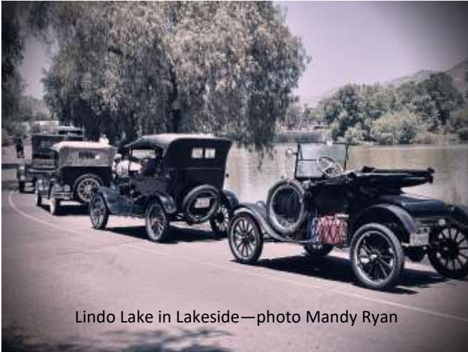
Lindo Lake in Lakeside