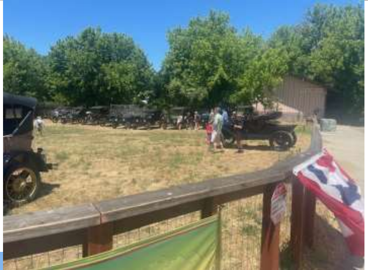
Overflow parking after Main Street parking maxed out. —Kirby Pray