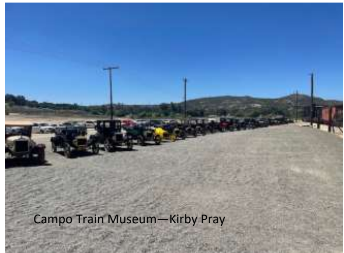
Campo Train Museum—Kirby Pray