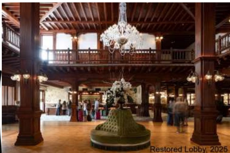
Restored Lobby, 2025

General – May 14; July 9; Sept 10; Nov 12