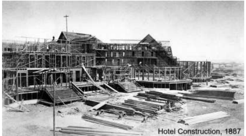
Hotel Construction, 1887

One of the last-surviving Victorian -era wooden beach resorts in the world, the Hotel del Coronado ("Hotel Del" for short) begins its story in the mid-1880s with the purchase of 4,000 acres of land on Coronado Island for a measly $110,000 (about $3.1 million today... what a deal!) by a group of five former executives. At that time, it was common for a California developer to build a