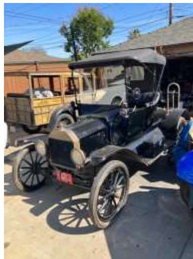
Don B 15 roadster

Please contact Peter Eastwood for details