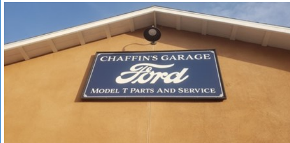
Chaffin's new hand-painted sign.

I spent Christmas at my sister's ranch near Elko, NV. All four of her kids and eight grandchildren were there. The little ones were ages one to seven years-old. Those one-year-olds scoot around super-fast and get into everything! The snow-covered ground was beautiful, and I experienced my first white Christmas. Fortunately, it didn't snow on the way up, but it might snow on my trip home.