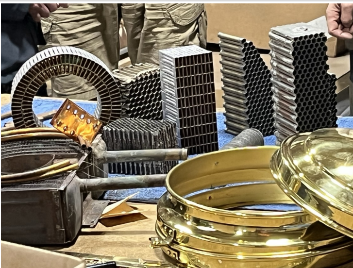
Assorted radiator cores at Brassworks in Paso Robles. [California Rendezvous tour]